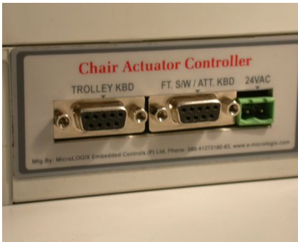
Dental Chair Controller