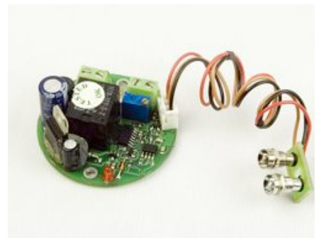
Sensor Light Control

As they are standard products, they are available with short lead times to meet customer needs. Special OEM pricing for regular requirements