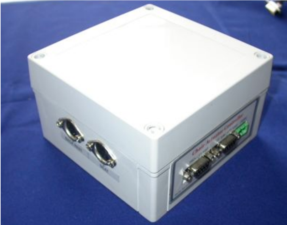
Chair Actuator Controller