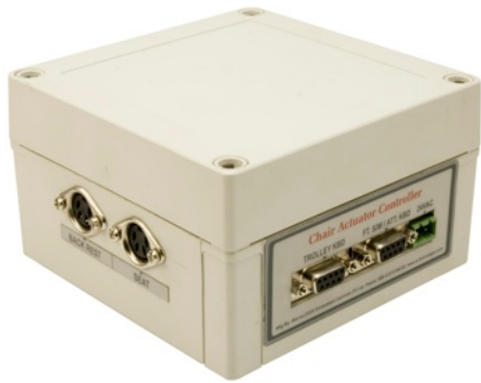
2 Axis Actuator Controller